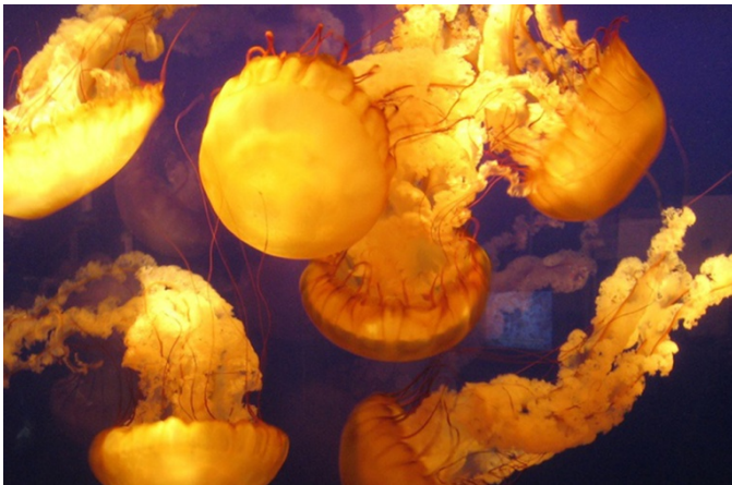
Photo: Jellyfish display, Ocean Journey building, the Tennessee Aquarium.

Once formalized, the consolidation fundamentally changed the operational structure and staffing of the three institutions. Although each retained its individual identity and continued to be governed by its respective board, the institutions now share four directors: HR, Finance/Accounting (CFO), IT and Marketing, and Retail Sales. This structure is at the core of the consolidation, and as the lead partner, the Aquarium employs the four shared directors who report to the Aquarium's CEO as well as the Directors of the CDM and the Hunter.