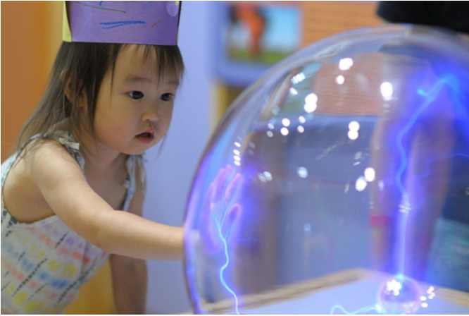
Photo: Inventors' Clubhouse, Creative Discovery Museum.

connections to the community and provide educational support to schools and social service agencies. In addition to the cost savings and revenue generated for the Aquarium, the consolidation enabled the museums to undertake a joint fundraising and capital campaign that raised $120 million.