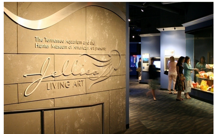
Photo: Gallery entrance to Jellies: Living Art , presented by the Tennessee Aquarium and the Hunter Museum of American Art.

and connect with the community. This detachment, which had left it unable to effectively serve its constituents, was further complicated by the museum's outdated operational infrastructure that took valuable staff time away from upgrading exhibits and designing innovative programs and would require a significant financial investment to modernize.